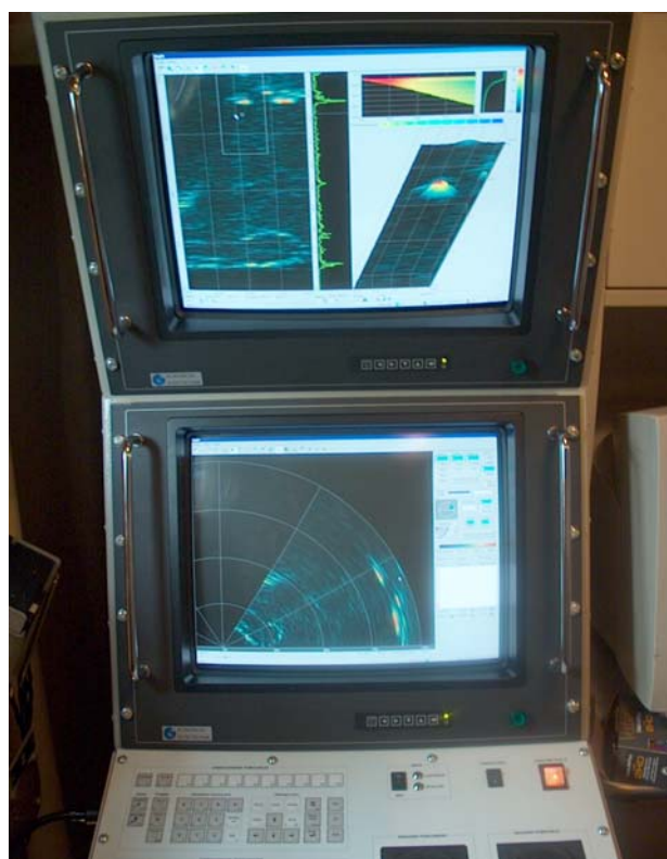
Fig.3 The operator console of the modernized MCM sonar