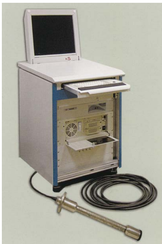
Fig.1 The parameter's controller of acoustic disturbance sources generated by a moving ship

An example of an implementation is the parameter's controller of acoustic disturbance sources generated by a moving ship (fig. 1). This system consists of a set of high sensitivity sensors in a configuration, which enables measurements of acoustic field pressure and intensity. On the basis of measurement results, it is possible to locate the main sources of the ship noise, assess their level and contribution to total noise. The system enables data acquisition and determination of the trend of technical parameters change in function of time, during the lifetime of the ship. It is very important for the ship's passive defence and effective maintenance of ship machinery. This and other systems have been applied to modernise measurement stations at the naval ports in Gdynia and Świnoujście.