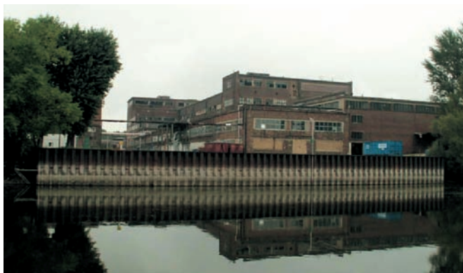
Fig. 2. Trans-shipment berth in Kostrzyn (own photo, August 2006).

Moreover, the port of Kostrzyn has berths belonging to industrial plants situated on the Warta River. One of them is shown in Fig. 2. Author's personal observations, made in August 2006, have revealed that cargo is not shipped in those places.