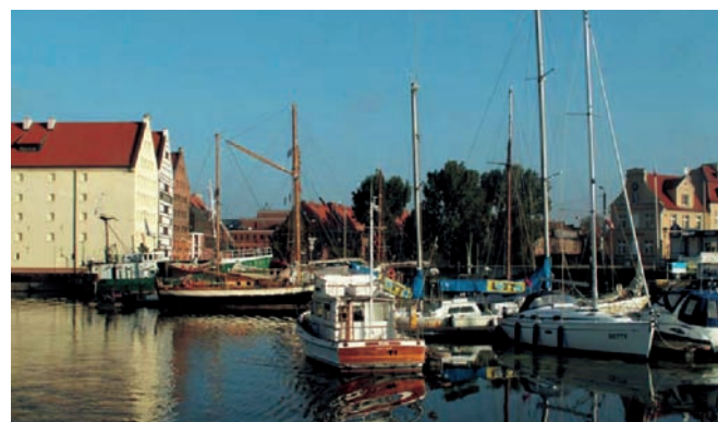
Fig. 5. Gdansk marina in Szafarnia street (own photo, August 2006).

The City of Gdansk (Development Programme Department) also sees its chances in activating the river network within agglomeration reach. Compared to the density of water routes the port base is extremely poor. The pride of the city – the marina on the Motława River (Fig. 5) is practically deprived of necessary land infrastructure. The remaining few ports are situated at a relatively large distance from the downtown, far from the hotels, gastronomy, and tourists attractions (Fig. 6). Therefore 26 places were selected on the territory of Gdansk as possible locations of small ports available for water tourists. The project of detailed technological designs is currently being worked out by „Hydroprojekt” in Włocławek.