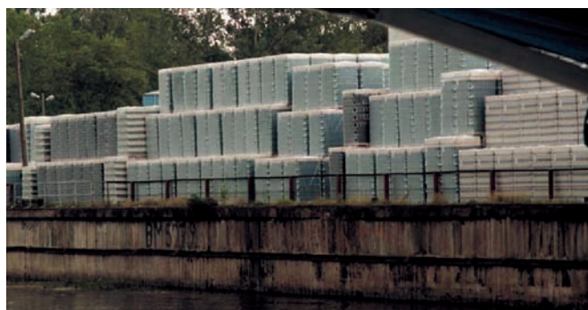
Fig. 3. Port of Ujście on the Noteć River, out of operation for 10 years (own photo, August 2006).