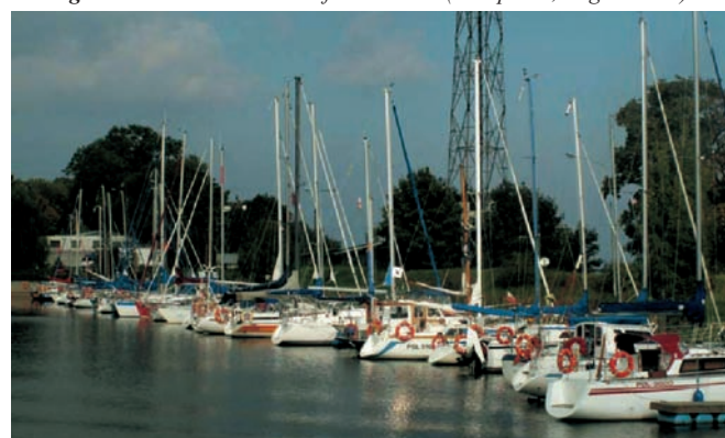
Fig. 6. Yacht port on Dead Vistula River (own photo, August 2006).

The initiative of Gdansk and Elbląg authorities is a good example for other towns situated on waterways, which were included to the European water network. Only developing the existing ports, and building new ones for tourists navigation purposes can again bring Polish water navigation routes into life.