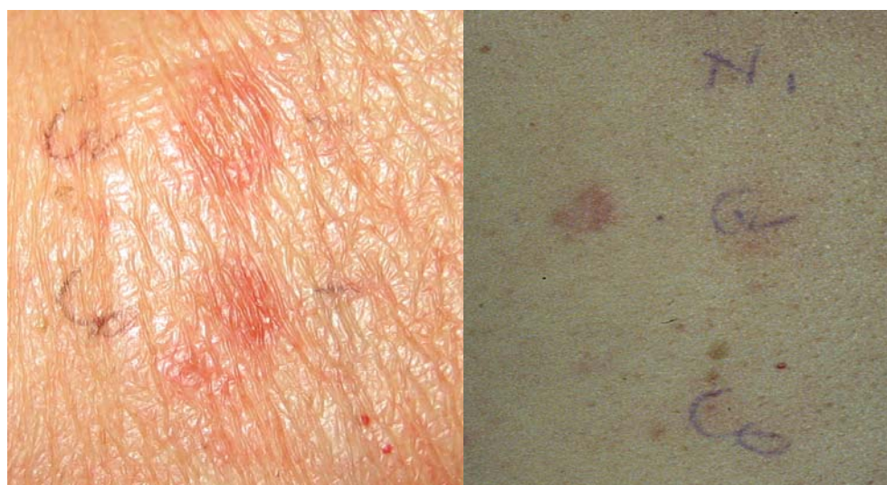
Fig.3. Skin changes after performing the tests

The patients (6) were subjected to the tests on the Ni, Cr, Co allergens (Fig.3).