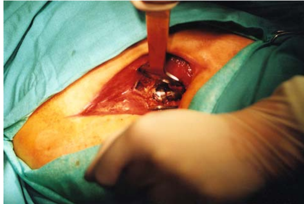
Fig.4. The hip implant removing caused by aseptic loosening

Two of them (1,2) had their implants removed due to aseptic loosening and intolerance of endoprosthesis. It resulted in pain, fistula serosa and edema. There were found to have oversensitiveness to Cr and Co. The allergic were not diminished by using antihistaminic drugs (Fig.4).