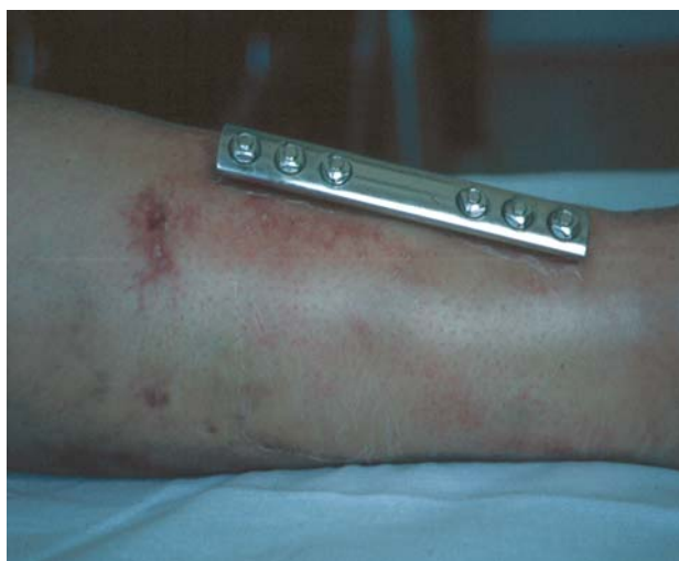
Fig.7. The contact dermatitis on the skin surface

The patients (5,6) whose bones were joint with ZESPOL method, positive reaction to Cr and Ni was found. It appeared as contact dermatitis covering a large area of the skin, not only in the implant-tissue area (Fig.7). Some disturbances in the bone growth was observed. Treatment with antyalergic drugs was ineffective. After 4 weeks the implants were removed and the patients were treated in cast.