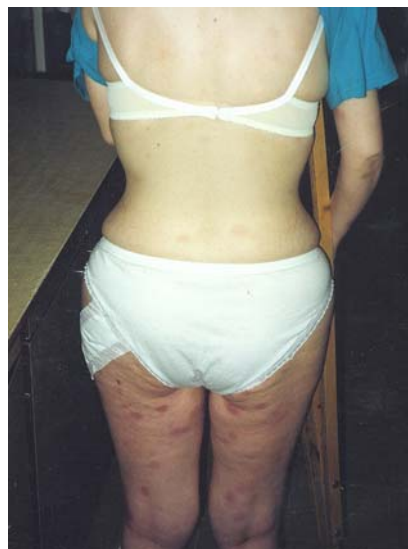
Fig.5. The patient with Ni sensitiveness after applying hip prothesis

The patient (3) with Ni allergy suffered from skin imperfections after introducing hip implant (Fig.5). The symptoms decreased after applying antihistaminic drugs.