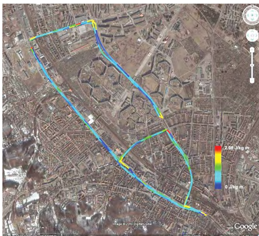
Fig. 2. Map of operating conditions - the specific energy consumption ( \bar{\Phi} )

Gdansk) have been tested. Studies, because of the need to reduce costs, have been made in the 9 01 -12 00 hours (short travel time) on weekdays, but each test was repeated 6 times. Results presented below relate to data averaged for the 7 trials for each segment explored. Graphical representation of multidimensional characteristics (10) will be the geographical map of the area with marked tested road sections, to which vector values of \mathbf{Y}_M (9) were assigned after the road test. The present work contains an example of such a graphical representation of one parameter of vector \mathbf{Y}_M (9) performed with the use of original software that uses the geographical maps available in the application "Google Earth" (Fig. 2). The scale of values and corresponding colours were added to the graph in the form of colours bar.