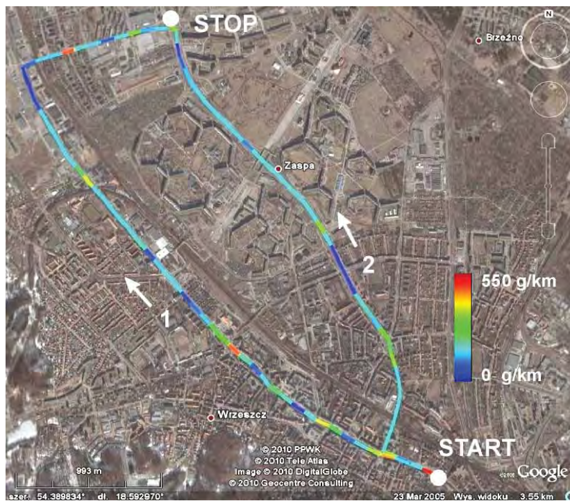
Fig. 3. CO 2 emissions on the routes: 1N i 2N

A more detailed analysis of the results enables its graphic form, which was reproduced in Fig. 3.