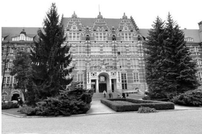
Fig. 17. The Main Building of the Technical University of Gdańsk ( Politechnika Gdańska).