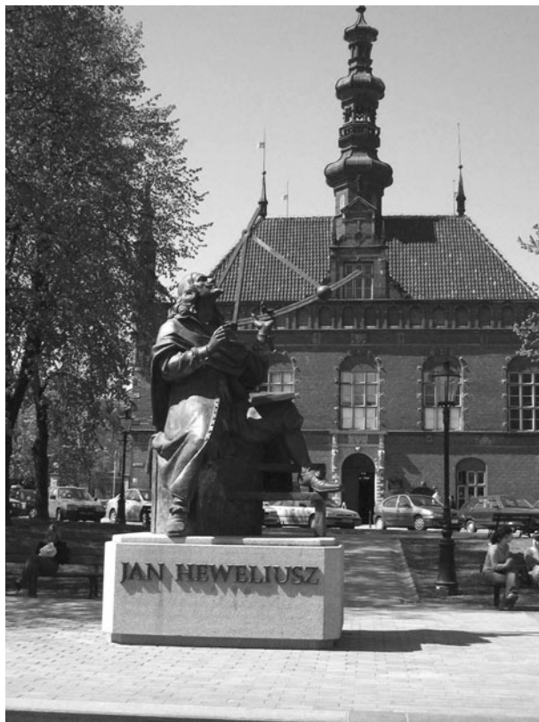
Fig. 14. The monument to Johannes Hevelius (1611–1687).

Hevelius also continued to measure the magnetic declination in Gdańsk and discovered its secular changes. Another Polish King, Jan II Kazimierz (1609–1672), rightly claimed that Hevelius “will be the ornament and pride of Gdańsk in the centuries to come,” 16 as future generations confirmed. They erected an impressive monument to Hevelius in front of the Town Hall in the Old Town (figure 14). The Town Hall, built by Anthoni van Obberghen (1543–1611) in 1594 and not destroyed in the last war is very worthwhile visiting. In its two-story cellars Hevelius used to store his beer. In the large Hall on the upper floor he attended assemblies and sessions of the court.