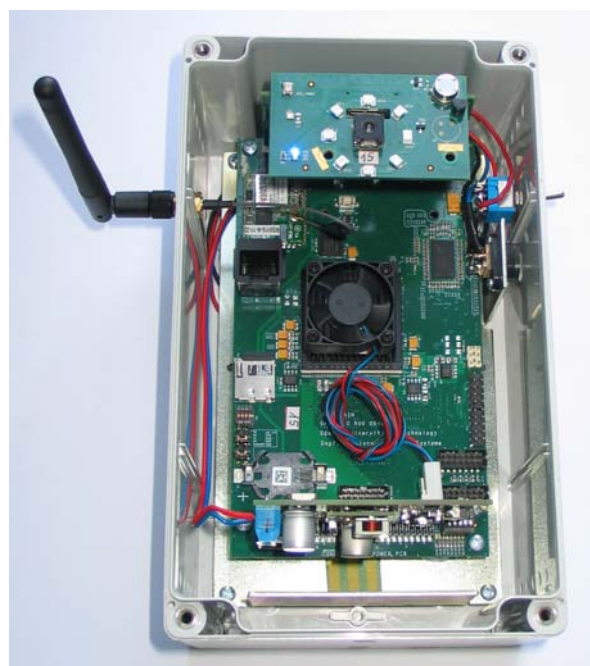
Fig.1. Photo of the prototyping system

controlled by the microcontroller which is also used for power control and measurement of power voltages and currents. The configuration bitstream can be encrypted – a battery socket for the FPGA decryption key memory is supported. An additional reset IC controls reset signal assertion after power on and when the reset push button is pressed. There is also a LED for the configuration process status signalling. A 100 MHz oscillator with differential output is connected to the FPGA to serve as a local clock source.