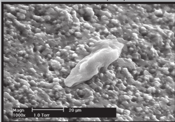
FIG.3. The view of the surface with biofilm (1000x)