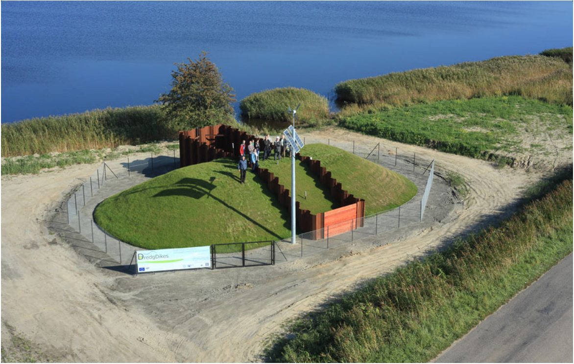
Fig. 1. The view of the experimental dike in Poland

The Fig. 1. presents the general view of the experimental dike near Gdansk – after completion. The dike body forms the composite material consisting of 70% ash and 30% sand. The mixture was carefully chosen after the series of the laboratory tests, in procedure as described above. The total dimensions of the dike are: height 3 m, width 15 m, length: 24 m, with slopes inclined by ratio 1:2. The cross-section of the construction is presented in the Fig. 2.