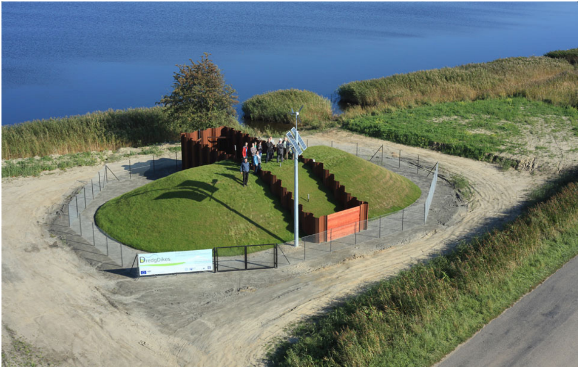
Fig. 1. The view of the experimental dike in Poland

The Fig. 1. presents the general view of the experimental dike near Gdansk – after completion. The dike body forms the composite material consisting of 70% ash and 30% sand. The mixture was carefully chosen after the series of the laboratory tests, in procedure as described above. The total dimensions of the dike are: height 3 m, width 15 m, length: 24 m, with slopes inclined by ratio 1:2. The cross-section of the construction is presented in the Fig. 2.