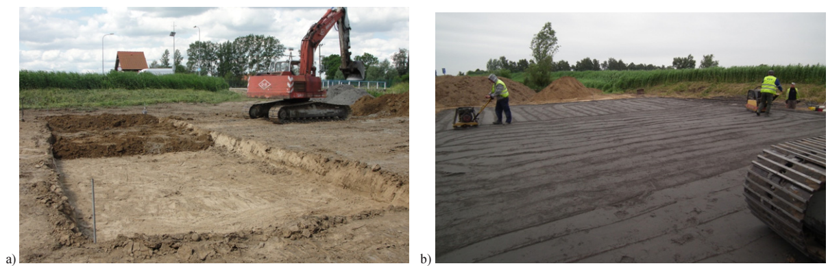
Fig. 4. Construction stages: (a) preparation – removal of soft soil (b) compaction of single layer of dike body

The construction stages should be carefully planned and verified. After preparation phase – removal of unnecessary organic and soft layers of soil (Fig. 4a), one of important aspects is compaction control of the dike body during construction. In Fig. 4b one can see early stage of the dike construction and a classical technology of compaction – in case of small structures. It is clear that in case of larger structures one will use proper, heavy equipment [10]. Each layer of the construction needs to be controlled and the compaction verified (see Fig. 5a). In this case one can see clearly advantages of used composite – even heavy machines make no visible deformation of the dike body (see Fig. 5a). The last step is to create the bio-surface of the dike, the greening can be achieved by hydroseeding or other techniques; the final view of experimental dike is presented in the Fig. 1.