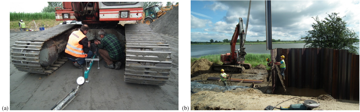
Fig. 5. Construction stages: (a) compaction verification – plate loading test (b) installation of sheet-pile wall

One of the first experiments will simulate the flood rise of water level 0.5 m below the dike top with duration of one week and then its subsequent decrease. After the analysis of the first experiments, subsequent scenarios will be deployed. Some overflowing experiments are planned as well in the end of project – to ensure the stability of the dike and to estimate the erosion processes [11].