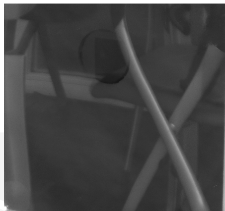
III. 2. Radiant colour film