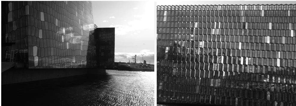
Ill. 5, 6. Harpa Concert Hall and Conference Centre

The recent use of optical filter technologies has opened up new possibilities for creating an image of the building facade as an envelope that deepens the sense of light and its variability, and consequently broadens the use of natural phenomena to create new aesthetics in architecture. Thanks to the new generation of optical filters that were created as a result of progress in materials science, facades that initiate a new relationship between inside and outside are being created; building envelopes are sensational transitory compositions of light and colorful landscapes whose common feature is volatility and unpredictability. The unique levels of sophistication of these heterogeneous para-natural compositions found on the facades, bring the built environment closer to natural conditions. By the visualization of and interaction with such facades, the range of aesthetic stimulus offered by architecture, can be greatly extended.