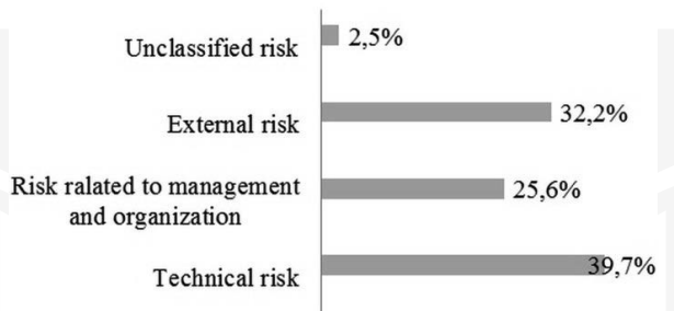
Fig. 1. Distribution of groups of risk sources to urban regeneration investment risk (self-sourced)

Assuming the most unfavourable circumstances of probability being 1.0 and impact of the risk factor being 5.0 risk values were established, so called range (probability x impact) for every factor. The summarised value of risk for every assembled factor allowed, in the next stage of research, standardization of variables in the range 0–1, which in turn allowed for defining an overall share of every analysed urban regeneration investment risk.