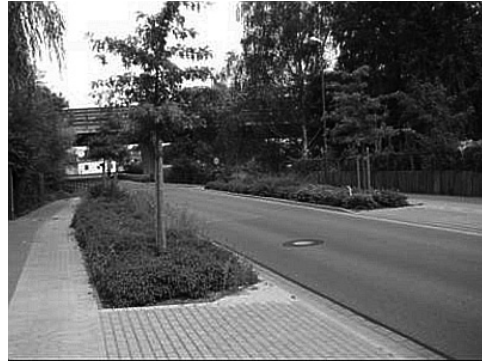
FIGURE 3. Natural gates to a town in Uelzen, Germany

ery itself may constitute an engineering measure which reduces speed, such as in the form of an entrance gate to a town (Fig. 3).