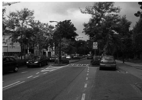
FIGURES 6 and 7. Natural barrier and entry to the 30 km per hour zone (K. Jamrozik, 2009)