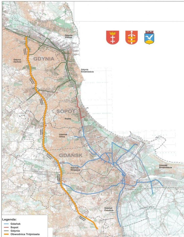
Fig. 1 The streets of the Tri-City included in TRISTAR system.

The architecture defines a four-level, hierarchical functional structure (metropolitan, urban, zone and local management levels). The level of urban management, also called the strategic level or central management layer, covers urban traffic management in the Tri-City. Key demands will be implemented at this level in accordance with the transport policies of the cities that form part of the Tri-City Conurbation. The primary function of the central level, physically located in two Transport Management Centres (in Gdańsk and Gdynia) is the integration of all the systems (subsystems) included in the on-going stage of TRISTAR system implementation (Fig. 2) [4].