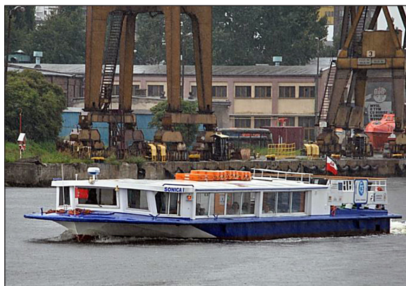
Fig. 5. Sonic I during a course on line F5 [14]