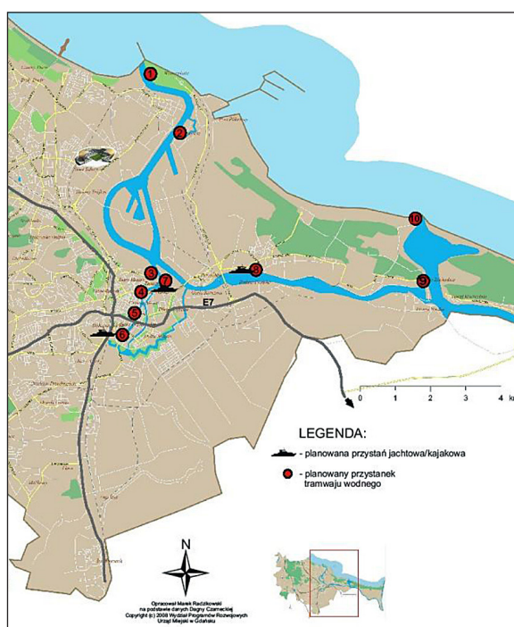
Fig. 1. Deployment of the PODWwG infrastructure [4]