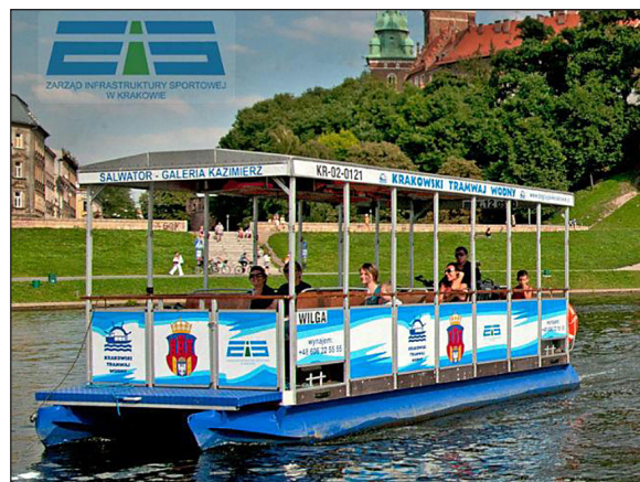
Fig. 8. Krakow water tram [22]