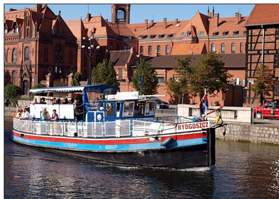
Fig. 6. Historic motor powered ship m/s Bydgoszcz [20]

tions adopted in Bydgoszcz, Gdansk and Krakow were placed in the table in condemning whether the factor is closer to the solution adopted in the transport and tourist transport. The data from the analysis are summarized in Table 2.