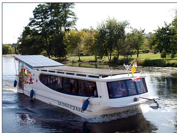
Fig. 7. Two solar-powered ships “Słonecznik” and “Słonecznik II” [21]