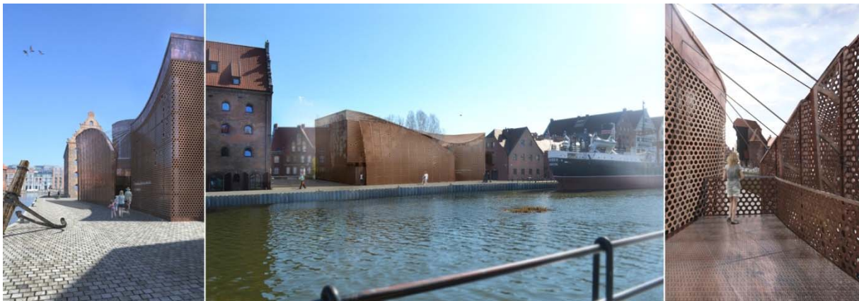
Fig. 5. 2 nd prize in the contest (by M. Skołučka and M. Napiórkowski).