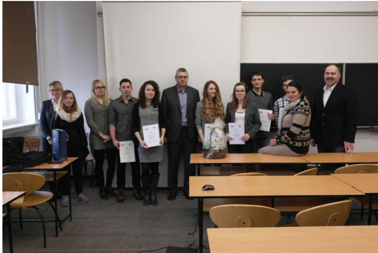
Fig. 3. Competition results and awards ceremony (E. Marczak).