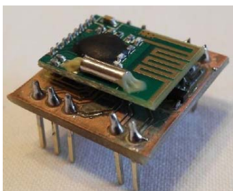
Fig.2. Exemplary prototype of a remote measurement module

Because the system can be easily expanded, two types of the expansions modules were designed: measurement modules and control modules, each of them can be connected with the central unit locally (using wires) or remotely (wirelessly). The measurement modules are responsible for determining selected environmental parameters with the aid of the dedicated sensors. The control modules work as output devices; they make driving selected instruments possible with the help of the user messages or in an automated way. In both cases, the microcontroller manages modules activity and makes decisions concerning the measurement (or control) data destination (saving to the nonvolatile memory, response message to the user, etc.). The example view of a simple remote measurement module is presented in Fig.2