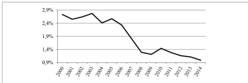
FIGURE 3. Work “in the shadow economy” as a percentage of total employment.

In this section, we analyse a specific type of informal workers. Because of the data limitations, we use particular information from the Labour Force Survey to indicate unemployed people who undertake any kind of work 5 . This method, used in other studies (Cichocki & Tyrowicz, 2011; Tyrowicz & Cichocki, 2011), relies on comparing two answers in the LFS questionnaire: firstly, about current occupational activity (meaning, if a respondent performed any work in last week); secondly, about being registered in a local labour office. A double positive answer is considered as identification of informal work (Cichocki & Tyrowicz, 2011). Obviously, by using this method we analyse only a single type of informal workers, namely those who declare their unemployment. Other types of informal employment, such as employees in formal entities with second unregistered jobs, bogus self-employed individuals or workers who receive enveloped wages cannot be analysed using this kind of data. Results of our estimations are presented in Figure 3.