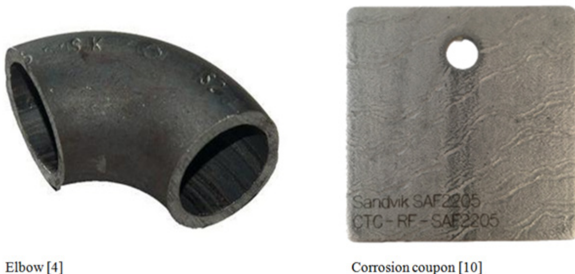
Fig.1. The elbow and the corrosion coupon

There are two ways to study the destruction rate of pipeline components. First way is to test the real items. Those items can be: straight pipe sections, elbows, valves, tees and the other pipe fittings. The second way is to use substitutes, for example the corrosion coupons. According to [9]: “Coupons are pieces of metal that are available in varying shapes, sizes and materials. They are composed of the same chemical composition as the equipment to be monitored. Corrosion coupons are exposed to a corrosive solution similar to that in process facilities for a specified period of time, and can give visual signs of the corrosion rate and type”. Examples of the real elbow and the corrosion coupon are presented in Fig.1.