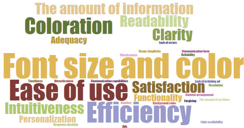
Figure 2. The cloud of the first branch factors produced by “nominal” groups

After performing such a procedure, the results are ready to be compared and evaluated. For this purpose, we developed the following procedure.