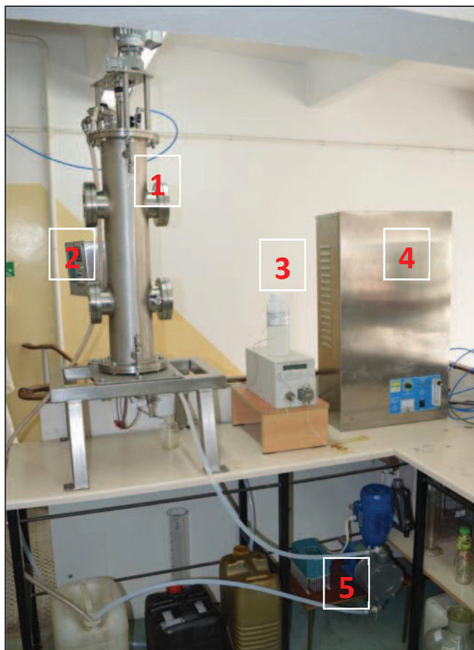
Fig. 1 A batch reactor for classic AOPs. 1- reactor, 2 – control panel (mixing and temperature), 3 – pump for oxidant, 4 – ozonator, 5 – pump for effluents

(2) a second one for hydrodynamic based AOPs (fig. 2)