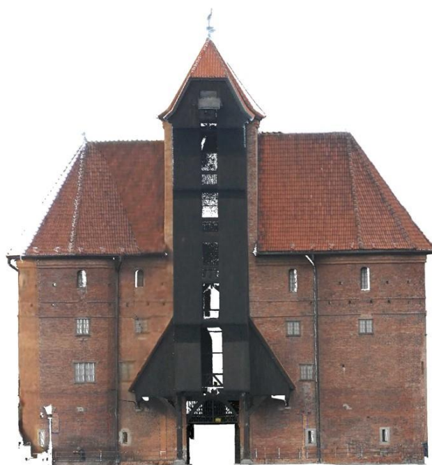
Fig. 5 The front elevation of the crane in Motlata river, Gdansk

Most of the projects that have been ordered are very challenging. Besides the final product the technological aspects of the technology are difficult to understand and with such complex projects as architectural inventories there could be a need to create an expertise to validate the collected data. Besides these tasks, there is a need to educate people about this field of measurements to create base of potential clients which are aware of advantages of using innovative measuring technology. The one of the example of the project, which has been accomplished, was creating documentation about the Crane in Motlawa River, in Gdansk, Poland which is listed by the conservation office. The object was very complex and it took more than two hundred scanner positions to acquire detail information about the whole building. Number of scan stations depended on many details inside the structure and narrow passages obstructing the laser swath. Combined point cloud, showed that besides the fact, that Crane was rebuilt after the Second World War, the walls were not straight. Based on that assumption, the quality of acquired model was doubted and it was essential to get independent expertize. The evaluation of the post-processed data based on checking the correctness of the created model. The expertise was made where the standard deviation of the whole model was calculated.