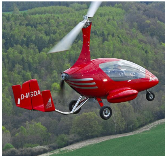
Fig. 4 Gyroplane, which is used for mapping using Airborne Laser Scanning