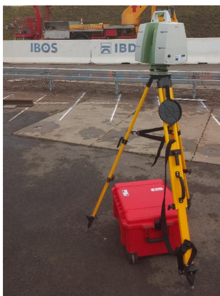
Fig. 1 Leica C10 laser scanner, placed on the tripod.

In Architectural Inventory the most commonly used is terrestrial laser scanning. It is represented by a scanner mount on a tripod.