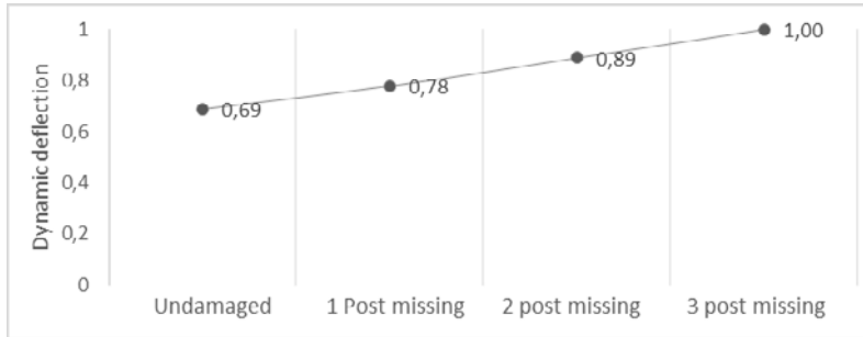
Fig. 1. Simulation results of the barrier crash where the post links into the guardrail.

One of the tests analysed the effects of a missing or damaged post on barrier performance upon a crash. To that end a simulation was conducted using the finite element method in the programme LS-DYNA. The simulation was validated based on available literature data from previous crash tests. The simulation was designed to test how many posts can be removed while still keeping the operational performance of the barrier. The simulations were conducted for 1, 2 and 3 missing posts (Fig. 1) with the crashes conducted at two points: at the beginning of an unsupported span and mid-span where the missing post should be.