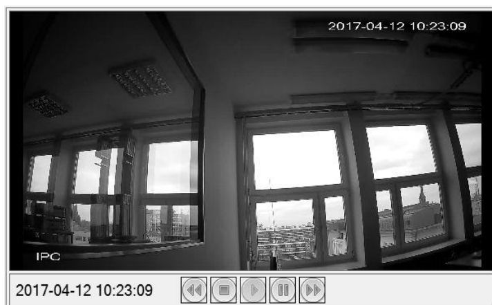
Fig. 3. A view of VideoUserControl during the visualization of video recording [own work]