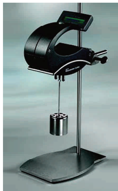
Fig. 1. General view of portable rotational viscometer VT1 Plus type produced by HAAKE [4]

producer viscosity of the fuel oil injected to the combustion chamber, at the accuracy of 0.5 cSt. Especially critical process is the regulation of viscosity of the fuel oil in conditions of switching from supplying the engine with marine diesel oil fuel (start-up and lay-off) to heavy fuel oil (long-lasting operation) and reverse. Similar problems are connected with testing the biofuels e.g. methanol, more often applied in sea transport. Thus, most urgent metrological problem of constructed laboratory test bed was to select and properly assembly the viscometer, which would enable for the quick enough (several seconds) measurement of the kinematic viscosity of the fuel at the inlet of the injection pump of the engine. After analysis of the offers available on the Polish market, it was decided to select a portable rotational viscometer of VT1 Plus type, produced by HAAKE company, of measurement range 1.5–330 mPa·s – Fig. 1. In order to estimate the momentary kinematic viscosity of the fuel in place of the VT1 Plus viscometer installation, it is necessary to shut equally quick electronic thermometer.