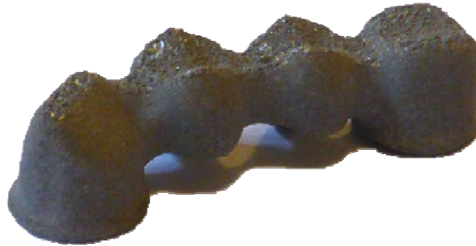
Fig. 2. The prosthetic bridge obtained by selective laser melting method (SLM) before sandblasting