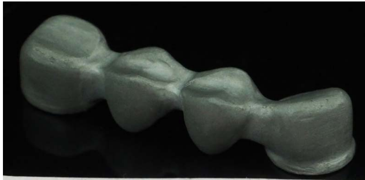
Fig. 3. The prosthetic bridge obtained by selective laser melting method (SLM) after sandblasting