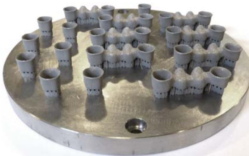
Fig. 1. The prosthetic foundations (crowns and bridges) on the titanium base plate obtained by selective laser melting method (SLM)

Fig. 1 shows the prosthetic foundations made by SLM method. Fig. 2 and Fig. 3 shows a single bridge (foundation) before and after sand-blasting with glass beads of a diameter of a 50 \mu\text{m} . Fig. 4 presents the results of the investigations the real prosthetic bridge reconstructed using the \mu\text{CT} method obtained by SLM and treated with sand-blasting.