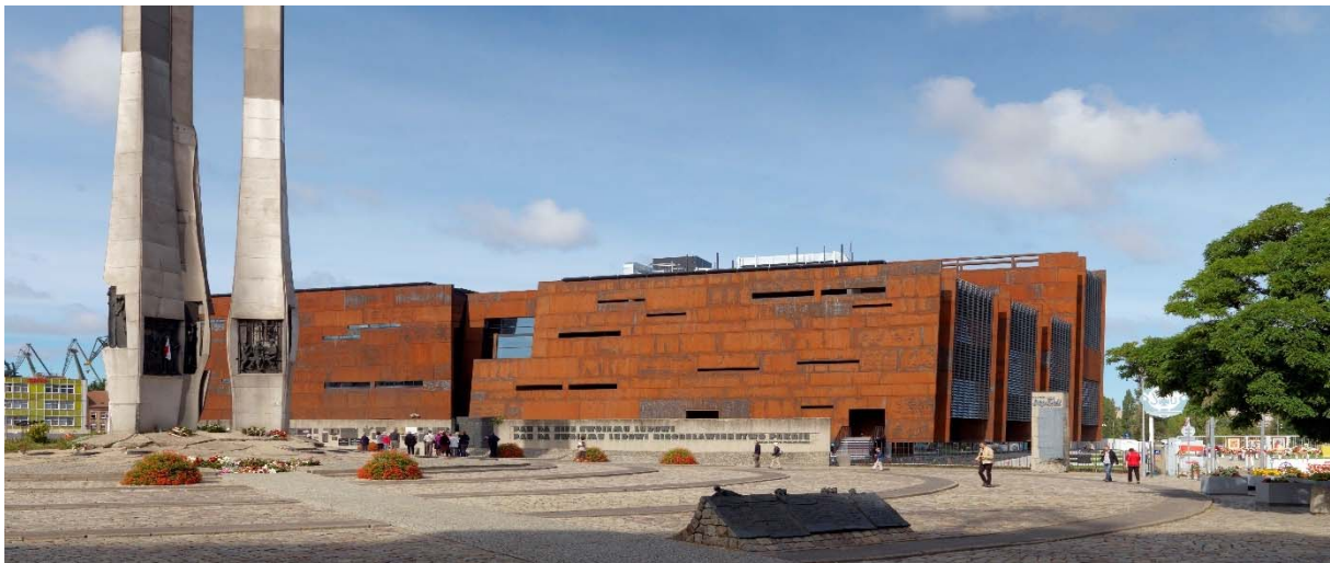
Figure 1. European Solidarity Center seen from Solidarity Square, photo: Wojciech Kryński, 2014.

The central point of the Square remains the monument of the three crosses. It is a space dominant (see Figure1). This spatial as well as symbolic role should not be questioned. That is why the building turns towards the square with raw metal plane almost without any holes, so as to descend to the background and become the screen for the statue's silhouette. The shadow of the cross rests on the flat surface of the façade, and their image literally and metaphorically deepens meaning of the building.