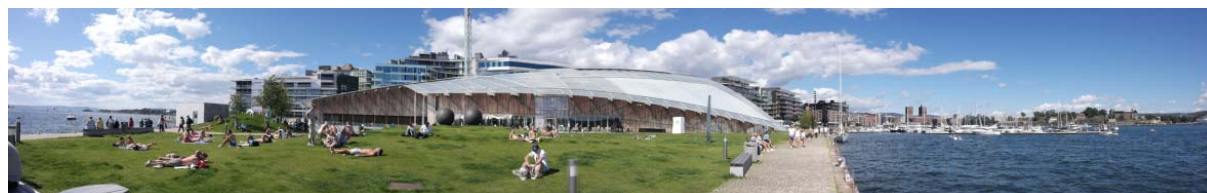
Figure 12. Contemporary Art Museum, Oslo, Norway.

Contemporary Art Museum in Oslo designed by an Italian architect Renzo Piano utilizes the location and its components to build up a local context to lend the building a form consistent with the buildings nearby. The sail-shaped roof stretches over two wings of the museum building, welding them together, alluding to its location by the water (Figure 12).