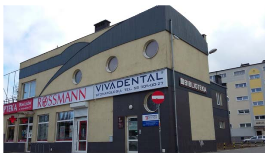
Figure 10. Public utility building, Gdynia, Stryjewskiego street, Poland

The round window resembling a porthole is a commonly recurring, popular naval reference which appears in present-day buildings. The round window is used regardless of its actual function or the size and location of the building (Figure 9, 10).