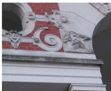
Figure 2. The man holding model of ships as a decoration above the side entrance to the building of the Gdansk University of Technology, Poland

Designing a building is a creative process requiring the designer to express his / her thoughts through an idea. This does not mean that an idea contained within an object must be complicated or sublime. A simple concept is very often sufficient to support an entire design and infuse it with expression that will evoke positive emotions in viewers [2].