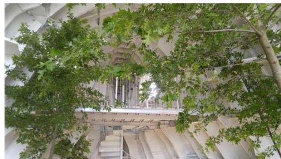
Figure 17 (a) (b). Spatial installation in front of the Contemporary Art Museum, Seoul, Korea [9]

The Contemporary Art Museum in Seoul has given young designers a chance to present their creative and innovative work. In front of the Museum, there was a spatial installation made from parts of the ship extracted from the seabed. The inside of the freshly-welded, capsized, white-painted hull was hiding a small garden (Figure 17 a, b).