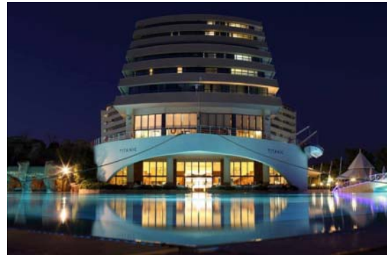
Figure 16. Titanic Hotel, Antalya, Turkey [8]

The above examples show that inspiration does not always drive creativity. This is connected with a lack of understanding for the phenomenon of inspiration which is short-lived. As a result, buildings come into being, whose form is the effect of a creative reworking of inspiration. These can be classified not only in terms of transcending the bounds of inspiration but also as an overinterpretation of the ship form.