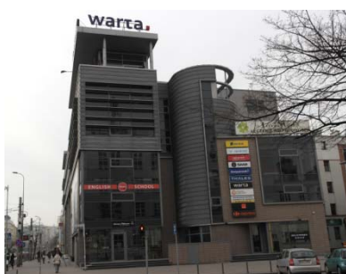
Figure 7. Office building, Gdynia, Władysława IV street, Poland