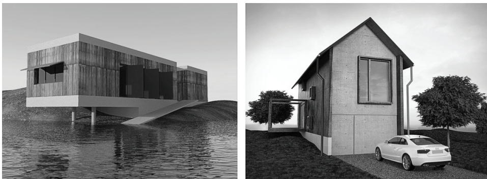
Figure 1. Left: basic rendering with Sunlight and Sky illumination only (Barbara Gwóźdź). Right: advanced rendering in V-Ray with HDRI Sky (Piotr Grabowski).

The Moodle platform adopted by the Gdańsk University of Technology does not allow teacher–students or student–student interactions in real time. Nevertheless, with additional communication via the platform, it has been possible to improve methodology, and to update and enrich the content to meet actual expectations and needs of the users. Looking from a teacher’s perspective, an important advantage of the online part of the course has been the ability to rapidly distribute uniform or customised learning materials, attach grades and comments to students’ homework, update a rating journal and schedules automatically, etc. From students’ perspective, personalised feedback, such as notes on how to solve tool problems, practical and troubleshooting tips (provided with huge commitment from the teacher), have been an extra advantage compared to the traditional formula. For a practical reason (one teacher and 110 students enrolled on the hybrid course each term), there was no agreement between the students and the teacher regarding the time to answer e-mailed questions, which sometimes resulted in delayed communication. Because the Moodle platform does not provide communication close to the same levels of fidelity as in the face-to-face environment, the teacher’s educational experience played an important role in verifying the credibility of home assignments authorship. Figure 1 shows students’ renderings at different difficulty levels: basic and advanced options.