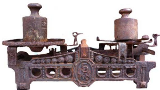
Figure 6. The cast iron kitchen utilities. On the left side: the waffle maker as a part of kitchen oven; on the right side: weighing machine with decoration of roses and information about maximum load

To allow temporary setting aside the hot pot from the stove furnace it was possible to use cast iron stands . In half of the 19 th century was particularly popular were circular rims or circular plates sometimes with holders, supported on three legs. Richly developed stands contained reliefs referring to the rococo period. They covered all visible surfaces. Less ornamental stands were cast as rosettes.