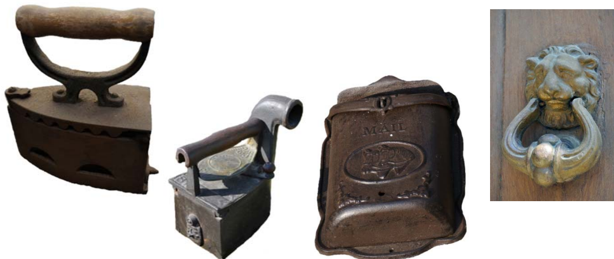
Figure 2. Cast iron irons with holes assuring the inflow of oxygen into the device with burning embers inside. On the left example: semi-circular holes on sides; on the right example: the hole in shape of pipe above the handle and a metal plate protecting hand from high temperature

batch and necessity of its replacement was obtained. Some of the irons had additionally decorative covers and handles.