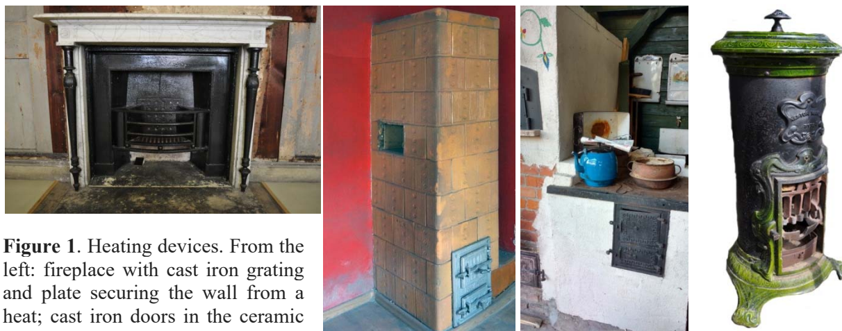
Figure 1. Heating devices. From the left: fireplace with cast iron grating and plate securing the wall from a heat; cast iron doors in the ceramic room furnace; cast iron doors in the kitchen oven; cast iron free-standing, cylinder oven with grating.

This feature in the household was used especially often. Cast iron was used to manufacture equipment that has direct contact with fire, but also items that are in contact for a short time or longer with high temperatures.