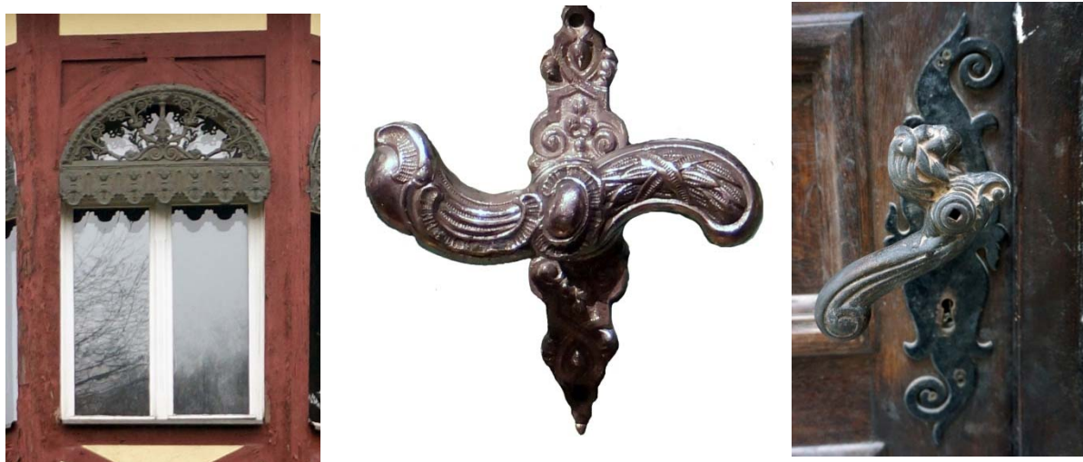
Figure 7. Cast iron elements of the elevation of the building; on the left side: lambrequin in form resembling the fabric; in the middle: window-handle; on the right side: door-handle in a shape of a lion.

2.5.2. With the increase in the level of hygiene in the kitchen began to use cast iron sinks . In the apartments of wealthy people, they began to ringfence the bathroom in which cast iron bathtubs started being in use. The sinks had a semi-circular shape with which a flat plate was attached to protect the wall from moisture. The baths were similar in plan to the rectangle. One of the shorter sides could be semicircular. Semicircularly ended edges made it easy and safe to enter and exit the bath. They stood on four feet sometimes reminiscent of animal feet. For obvious reasons, the interior of the sinks and baths were covered with white enamel. Poor people were still washing themselves in wooden dishpans and tubs or were using public baths. Their access to cast iron sinks and bathtubs was gradually progressing throughout the nineteenth century and beginning of the next century.