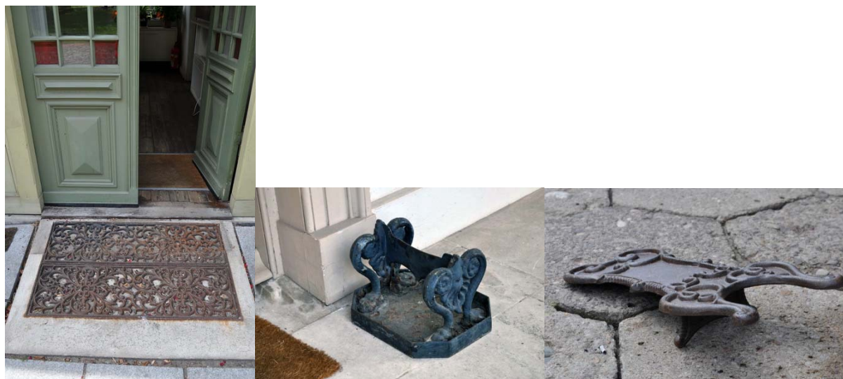
Figure 5. Cast iron items related to the shoes. On the left side: flat wiper with floral motifs; in the middle: the scraper with decoration on both sides and a tray for the dirt; on the right side: the puller used to remove the boots in a shape of angled plate with decorations and an indentation for the back of the shoe

The more impressive form was flat, rectangular ‘figure 5’, frequently semi-circular, cast iron panel of about 2-3 cm thick. Wiper could gain decoration with plant or geometric motifs between the holes. The upper surface of it was sharpened so that the incoming people, rubbing shoes on it, could get rid of the mud. Dirt was gathering in vacant places. The degree of filling the holes was an indication that the wiper had to be cleaned. Wipers of rich forms were also made and were located in the corridor.