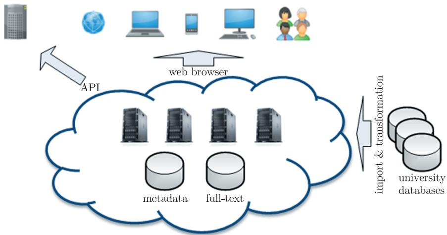
Figure 3. Overall architecture of the MOST Wiedzy platform

The MOST Wiedzy portal [12] is a web-based system running at the central data centre of the GUT and it is accessible via every web browser. The designed architecture of the platform is focused on ensuring a high level of security, availability and dependability. That is why its location has been applied in a private cloud which ensures appropriate redundancy and ease of scaling accordingly to the current system load. It is worth noting that the whole technology stack uses only open-source solutions such as Java, PHP, Kubernetes, WeaveScope and Docker [13]. Figure 3 depicts the overall architecture of the platform.