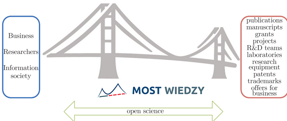
Figure 2. MOST Wiedzy project concept

The MOST Wiedzy system is a modern platform that offers multidisciplinary e-services, located in a private cloud of the GUT with a publically accessible universal API. The superior aim of the project is to make the knowledge easily accessible to the information society as well as to stimulate the R2B co-operation. As a result of this co-operation, some new innovations and resources will be produced that will extend the available resources of the platform. The concept of the project is illustrated in Figure 2.