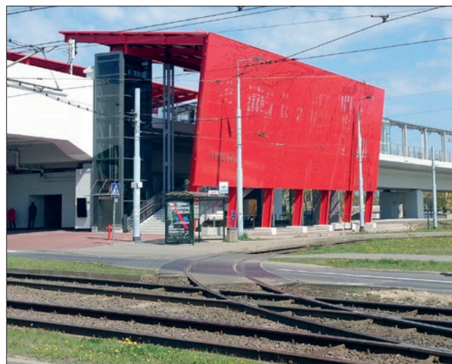
Figure 6 Metropolitan Railway Station – innercity intermodal junction