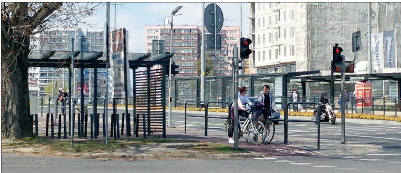
Figure 4 Bicycle infrastructure in Gdańsk