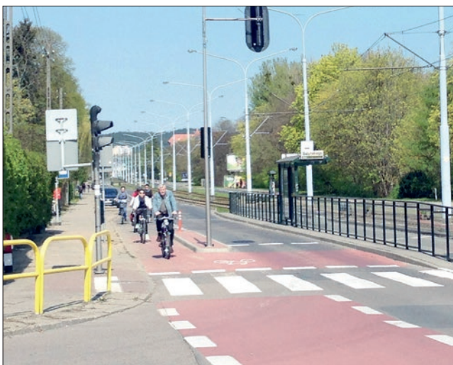
Figure 5 Bicycle infrastructure in Gdańsk

The essential large-scale investments currently being carried out will improve accessibility to answer the needs caused by deficits in the transport infrastructure inherited from the former system. This approach is juxtaposed with new concepts of mobility and sustainability. Only by balancing the present and future needs can a coherent strategy of polycentric development of the city-region be proposed.