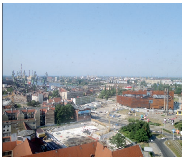
Figure 2 The 'Young City' seen in Gdańsk's post-shipyard transformation