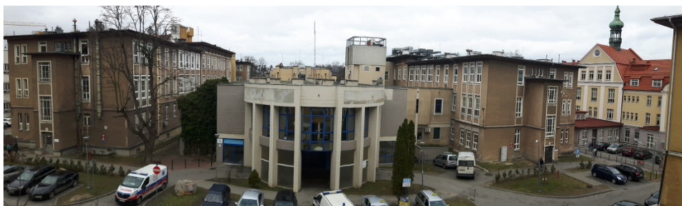
Figure 3: Hospital of Gdansk Medical University from the beginning of the 20 th century, with pavilion layout. The building of cardiovascular surgery unit with operating theatre, built during modernisation in the 1990s, is visible between historic pavilions. Modernisation and extension design by arch. A. Kohnke.

A design for hospital modernisation requires from its authors more knowledge and experience than in the situation when a hospital is designed from scratch. In the case of modernisation an architect, apart from the knowledge necessary to design health care facilities, must possess the skill to make compromise decisions, as modernisation often involves conditions and limitations which are difficult to reconcile. In modernisation of historic hospitals there is an additional difficulty, namely the necessity to design in compliance with monument-protection requirements, ensuring that historic buildings will be preserved in the state as unaltered as possible. In the case of hospitals, i.e. buildings with complex functional layout and the highest degree of technological saturation, it is a very