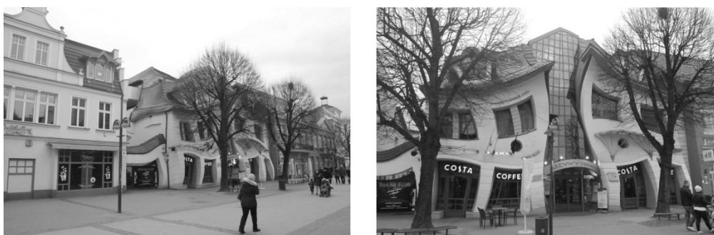
Figure 6. Today's architectural symbol of the city – an architectural joke, the so-called Crooked House in the street frontage

The so-called Crooked House is a characteristic building, constructed in 2004 and located in the frontage of Bohaterow Monte Cassino street - the main pedestrian precinct. The inspiration for this project were the works of a famous Polish artist – Jan Marcin Szancer, who was an illustrator of books for children [6]. Szancer's illustrations are magical, full of mystery and romanticism. The Crooked House does not possess any of these features – it is solely an architectural joke – despite the fact that it was constructed with the use of good-quality materials and has a certain charm. It should be located in an amusement park and not in the main street of a seaside spa with established identity, connected with the heritage of historic architecture from the turn of the 20th century. Like in the case of the Haffner Centre, the Crooked House may contribute to lowering the rank of Sopot – a cosy spa with unique character, which is currently being transformed into a popular, colourful and noisy place, similar to many others which can be found on the coast (figure 6).