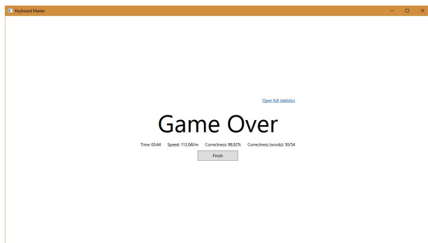
Fig. 3. The statistics screen

In both cases, the game can be paused by pressing escape button. As time is stopped, the screen is hidden with statistics about current play-through (time, speed in letters per minute, accuracy as the percentage of correctly entered letters and a relative number of correctly entered words). After finishing each of the games (either normally or by forcing the end from the pause menu), the user can view complete statistics and download a file containing all entered words with their correct forms and suggestions from the bi2quadro-grams algorithm (Fig. 3).