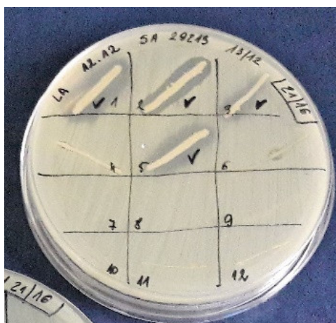
Figure 1. The growth inhibition zones of Staphylococcus aureus ATCC 25923.

Isolated colonies from the collection were transferred by sterile pipette tip (in the form of a spot or short line—0.5 to 1 cm) onto Petri dishes with solid growth medium (LB agar) inoculated by reference strains: Staphylococcus aureus ATCC 25923; S. aureus ATCC 29213; S. epidermidis 12228; Escherichia coli ATCC 25922; Listeria monocytogenes ATCC 7644; Pseudomonas aeruginosa ATCC 27857; and Candida albicans ATCC 10231. Inoculation was performed by streaking with a sterile cotton swab soaked in a suspension of each tested reference strain (final optical density of each suspension \text{OD}_{600} = 0.1 ). Plates were incubated over night at 37 °C. The observed halo zones (Figure 1) indicated the growth inhibition of reference strain and predestined colonies of bacteria isolated from honey for further research.