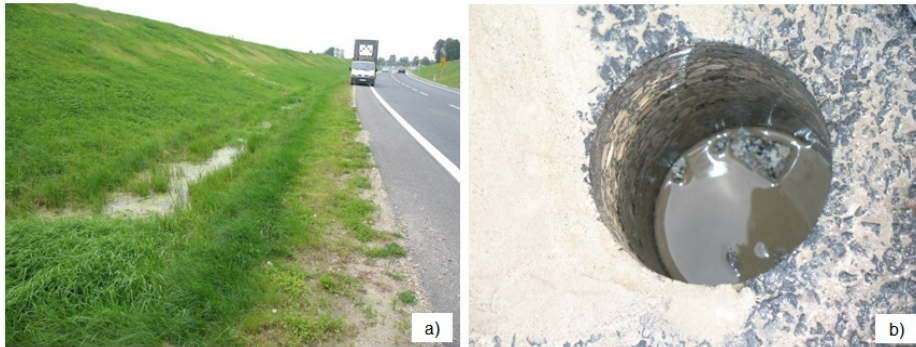
Fig. 3. a) section of road on which the drainage system is not functional; b) core extraction spot cleaned of dirt and water, spontaneously filling with water coming up from below.

The strongest extensive reflections are present in Case C, in which hydrological problems are dramatically demonstrated at the roadside (Fig. 3a), and water infiltrated into the borehole from below (Fig. 3b).