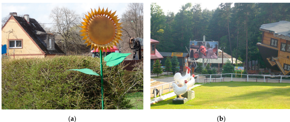
Figure 6. Rural tourism attractions: (a) the thematic village, Gogolewko Sunflower Village, West Pomeranian voivodeship; (b) the amusement park in Szymbark, Pomeranian voivodeship; private collection.

fantasies, and usually do not refer to the physiognomic features of the surroundings. This decides their visual distinction from the landscape background.