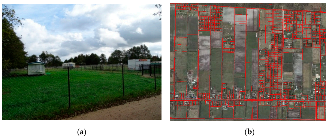
Figure 7. Fixed substandard tourist development, Karwieńskie Błota II, Pomeranian voivodeship, (a) the view of a divided long meadow; (b) the present cadastral map, www.geoportal.gov.pl , readable division process of protected long meadows; private collection.

Rural tourism infrastructure is permanently constituted by family farms in agrotourism, guesthouses, large hotel and conference centers, second homes, and holiday cottages, which are usually of an architecture that is deprived of local features or with exaggerated regional forms, and restored manor park complexes. The hotel accommodation base is often complemented by substandard temporary buildings in the form of sheds, gazebos, and caravans (Figure 7a).