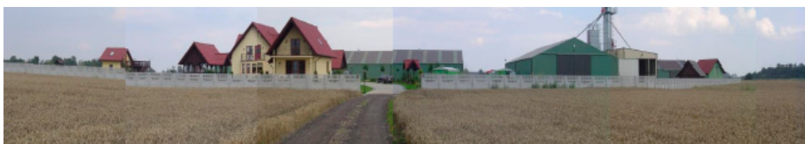
Figure 5. Buildings in intensive agriculture, Koszwały, Pomeranian voivodeship, private collection.

Monoculture is a system of industry agriculture. Intensive agricultural production usually enforces the removal of picturesque mid-field greenery, whose compositional function is based, for example, on defining the sequences of landscape interiors, or creating curtains, backstops, viewing closures, or accents in the form of individual trees. Cutting trees and shrubs causes a reduction of the positive aesthetic experiences of the observer (Figure 5). It also means the elimination of bird depots and ecological sites, which are valuable areas of biodiversity, as well as the reduction of wind power and the protection of soil from sterilization.