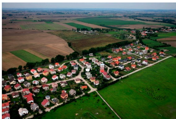
Figure 1. “Field-type” urbanization of rural areas, Szpęgawa, Pomeranian voivodeship, from the Pomeranian Agricultural Advisory Centre (Pomorski Ośrodek Doradztwa Rolniczego) collection.

New residential areas usually take the form of a roadside or a so-called field-type development (Figure 1), whose layout is managed by the existing ownership division of agricultural land that is reclassified for building areas, excluding previous merger and subsequent parceling. Small, one-family plots of land, which are usually marked on flat plains in the arrangement of “chocolate bars”, are developed in different periods of time or remain empty, which gives the effect of a visual dispersion. It is aggravated by the absence of ordering elements in the form of dominants, and the lack of tall trees (excluded due to small plot areas) and shrubs as a binding background. As a result, a typical feature of the composition of the contemporary view is “noisy” disorder and an extreme dissimilarity of forms or, on the contrary, their excessive uniformity in the absence of a hierarchy of motives. Landscapes of transformed rural settlements have an amorphous character (Figure 2a). The forms of the traditional agricultural village, on the contrary, were spatially organized: the village had a clear boundary; buildings with low intensity focused on the street or square, and there was greenery on the border of the house; it was surrounded by agricultural lands, which constituted a vast foreground for the view exhibition (Figure 2b). The preserved rural image determines the cultural identity, legal protection, or tourist attractiveness of the places today [42,43].