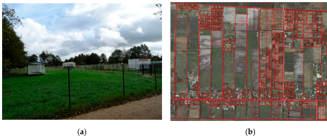
Figure 7. Fixed substandard tourist development, Karwieńskie Błota II, Pomeranian voivodeship, (a) the view of a divided long meadow; (b) the present cadastral map, www.geoportal.gov.pl , readable division process of protected long meadows; private collection.

Rural tourism infrastructure is permanently constituted by family farms in agrotourism, guesthouses, large hotel and conference centers, second homes, and holiday cottages, which are usually of an architecture that is deprived of local features or with exaggerated regional forms, and restored manor park complexes. The hotel accommodation base is often complemented by substandard temporary buildings in the form of sheds, gazebos, and caravans (Figure 7a).