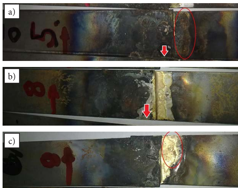
Fig. 2. Visual test results; a) specimen 5 – three copper inclusions, excessive spread of the brazing metal (ellipse), a crack of the braze and gas pores (arrow), the overlap on the upper edge not filled with the filler metal, b) specimen 8 – immersed in water, a crack of the braze (arrow), the overlap on the left edge not filled with the filler metal c) specimen 9 – provided with the flux used in the SAW method, excessive spread of the brazing metal (ellipse), gas pores, the overlap on the upper edge not filled with the filler metal

The radiographic tests were made using an Andrex X-ray tube (300 kV) and an AA 400+