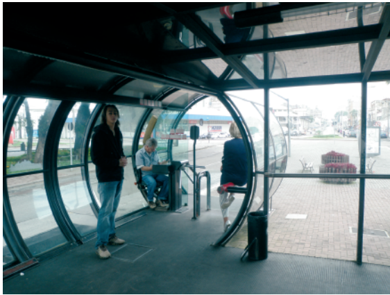
Figure 13. New workplaces in Curitiba – a person is selling tickets instead of ticket vending machine