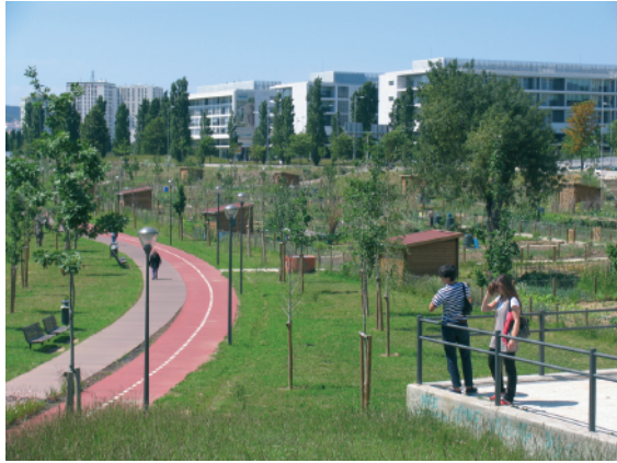
Figure 11. Allotments in one of the revitalized big-housing estates in Lisbon.