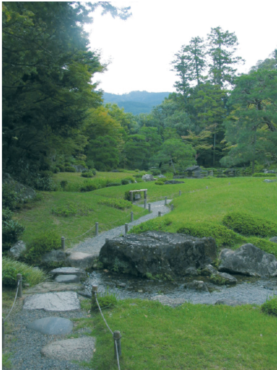
Figure 1. Murin-an garden, Kyoto, from Meiji period (1868–1912), composed with a borrowed scenery of distant hills (landscape architect Jifee Ogawa), surrounds historic villa from 1894-96 (today: national place of scenery).