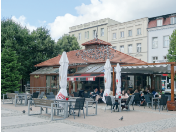
Figure 7. Town square in Wejherowo, Poland. Very popular place to spend free time not only for local people.