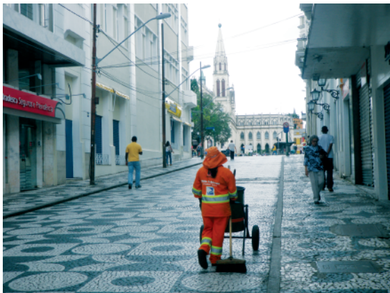
Figure 14. New workplaces in Curitiba – making the city clean