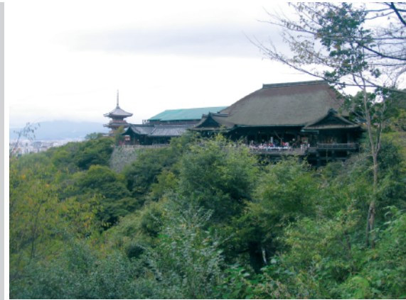
Figure 3. Kiyomizu-dera, Kyoto – a complex of buddist temples, more than 1200 years old, inscribed on the UNESCO list, situated on the Otowa Mountains Hill; Terraces offer views of Kyoto and surrounding landscape; Photo: A. Sas-Bojarska

Miłosz Walerzak [41] writes that the visual connections with surrounding landscapes were the essence of naturalistic composition (for example in England but he also provides many examples from Poland),