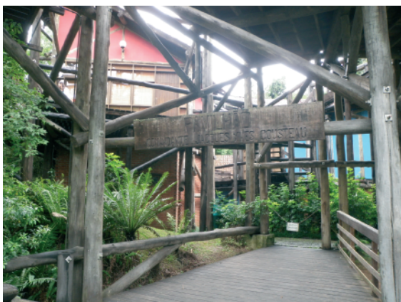
Figure 15. Vocational training center named after Jacques Cousteau in an inactive stone quarry – Curitiba

cities need to become health-affirming places is that “environmental quality is a major economic asset”