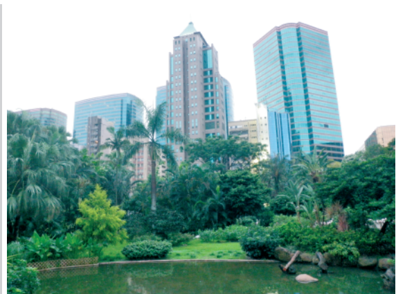
Figure 4. West Kowloon – artistic cultural district of Hong-Kong; beautifully landscaped garden (favored even by flamingoes), surrounded by high-rise residential and commercial buildings.

Anna Bengtsson and Patric Grahn have developed an outline of a Quality Evaluation Tool for healing gardens in healthcare settings [47]. Healing gardens in healthcare settings are a special kind of therapeutic landscapes . However, those qualities are easily applicable to everyday settings. The Quality Evaluation Tool can be used as a tool for every outdoor settings focused on mental and spiritual regeneration.