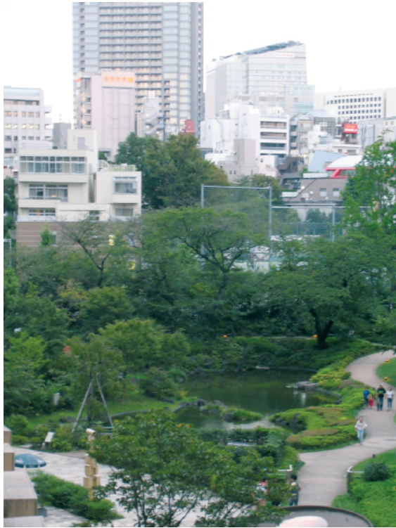
Figure 5. Japanese Mori Garden, situated at the foot of Roppongi Hills, revitalized district of Tokio, surrounded by the dense urban tissue of high-rise buildings.