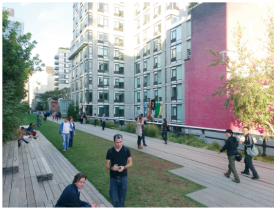
Figure 6. High Line, New York. Narrow belt of new public green space built on the unused railway viaduct, fitted between new and old buildings, became a catalyst for the neglected district's development.