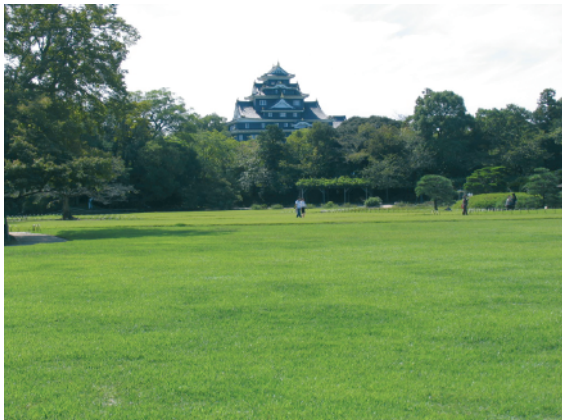
Figure 2. Public garden Kōraku-en, Okayama, build in 1700 r. (Edo period), one of three most beautiful gardens in Japan, composed with borrowed scenery of Okayama Tenshu-kaku castle (today: national special scenic spot)

Miłosz Walerzak [41] writes that the visual connections with surrounding landscapes were the essence of naturalistic composition (for example in England but he also provides many examples from Poland),