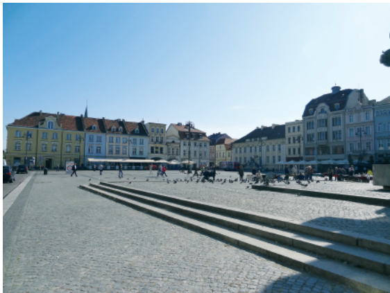
Figure 8. Town square in old town in Bydgoszcz, Poland. Very popular place, always full of people.