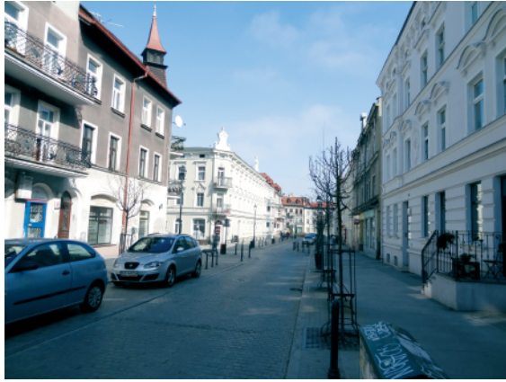
Figure 10. Revitalization and of a local street and placemaking efforts – Wajdeloty st. in Gdansk.