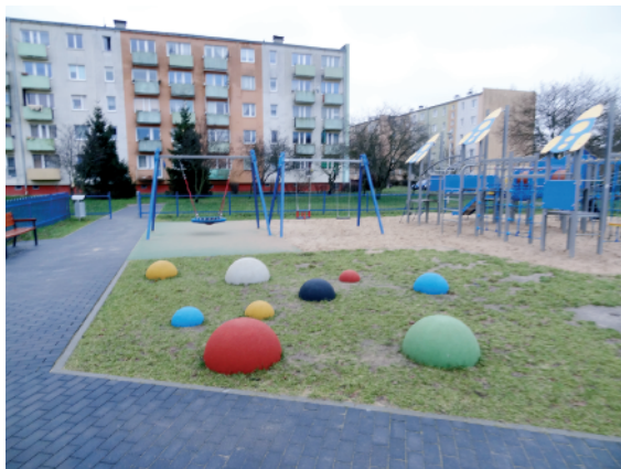
Figure 12. Playground in Gdynia funded by participatory budget.

environment. Strong social safety net is the best prevention against mental health problems. Many