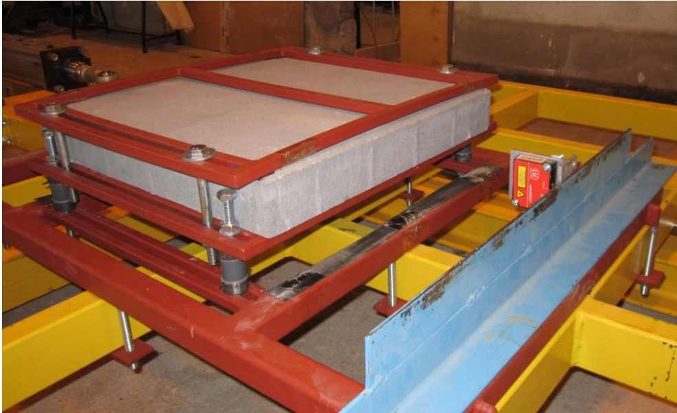
Figure 1. Concrete base slab supported by four PBs during dynamic oscillatory tests.