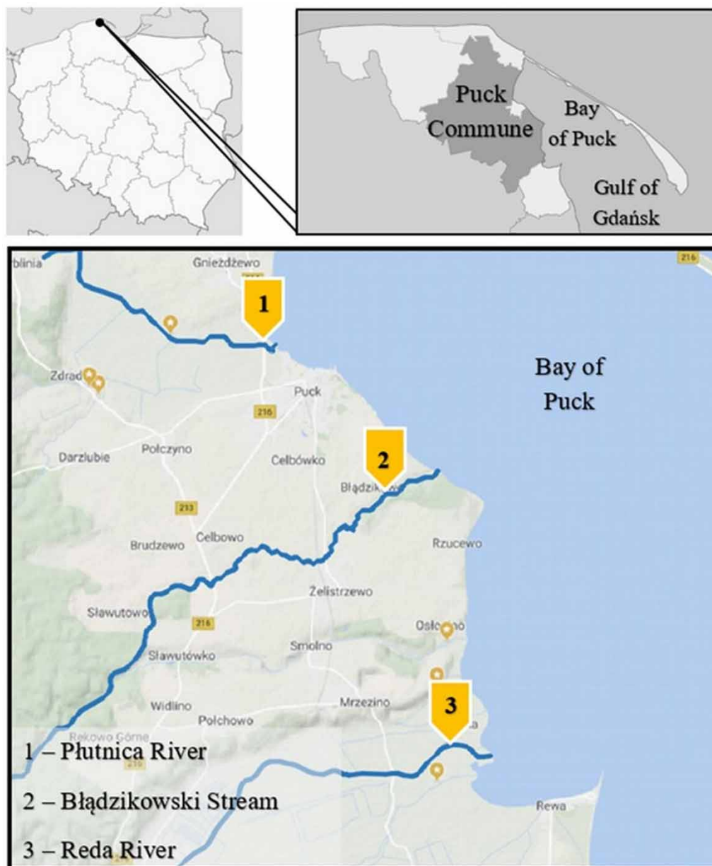
Figure 1 | Puck Municipality and location of measurement points (1–3) on analysed watercourses: Płutnica River, Bładzikowski Stream and Reda River.

were taken from the middle stream course using a sampler with an extension arm. The following analyses were performed: ammonium nitrogen ( \text{N-NH}_4 ), nitrite nitrogen ( \text{N-NO}_2 ), nitrate (V) nitrogen ( \text{N-NO}_3 ), total nitrogen (TN), phosphorus phosphate ( \text{P-PO}_4 ) and total phosphorus (TP). The determinations were carried out according to Polish Standards compatible with EU and US-EPA standards, immediately after the samples were