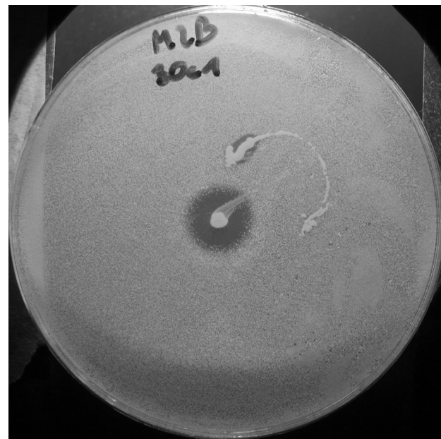
Fig. 1. Growth inhibition zone around the colony of producer strain M2B; an indicator strain – S. aureus 30C1.

Conditions for the effective production of the putative bacteriocin by S. xylosus M2B in a liquid culture were optimized in the terms of medium type, time period and incubation temperature. Comparison of