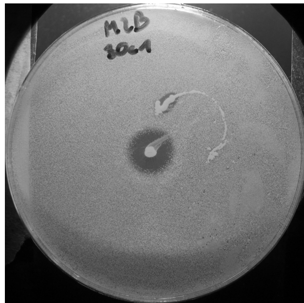
Fig. 1. Growth inhibition zone around the colony of producer strain M2B; an indicator strain – S. aureus 30C1.

Conditions for the effective production of the putative bacteriocin by S. xylosus M2B in a liquid culture were optimized in the terms of medium type, time period and incubation temperature. Comparison of