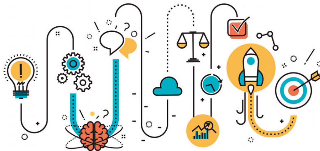
Figure 2 The above diagram indicates the potential complexity of artificial light on humans, involving many interconnected factors that create a cascade effect.

To further complicate matters, lighting practitioners, responsible for designing artificial lighting are overwhelmed with recently developed metrics such as: circadian action factor, melanopic sensitivity, melatonin suppression index, circadian light, etc., and they need clear guidance on which ones to use and why (see Fig.2). In Europe numerous associations with various task groups including SLL, CIBSE, and CIE are working around the clock on appropriate guidelines and standards; and overseas, IES is doing the same. But without proper, repeated long-term research involving humans of different ages, sex and sensitivity towards LED artificial lighting, all the proposed metrics might be just guesswork.