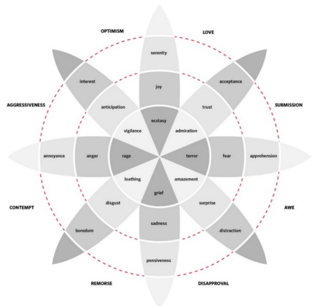
Figure 2. Plutchik's mood model.

A well-designed movie color palette evokes mood and sets the tone for the film. Filmmakers should understand color theory norms but never seen it as a limitation. Color theory for filmmakers is presented below in a tabular form (Table I), where the names of colors with matched emotions are contained. These are the most popular color in the film to create certain emotions in the viewer by the filmmaker [4].