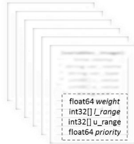
Fig. 2. Fields of SOEKS that allow them to participate in the processes of similarity, uncertainty, impreciseness, or incompleteness measures.

ciseness, or incompleteness measures to facilitate the indexing and retrieval purposes. These fields are: weight, priority, lower range and upper range [33], as shown in Fig 2.