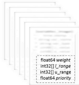
Fig. 2. Fields of SOEKS that allow them to participate in the processes of similarity, uncertainty, impreciseness, or incompleteness measures.

cisness, or incompleteness measures to facilitate the indexing and retrieval purposes. These fields are: weight, priority, lower range and upper range [33], as shown in Fig 2.