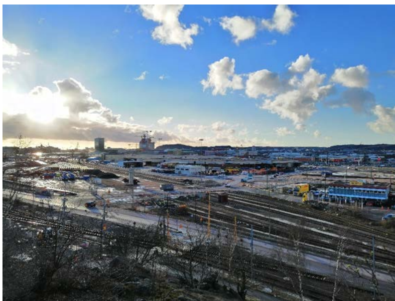
Figure 1: Project area Gullbergsvass district in Göteborg, Sweden (Source: Authors' photo).

The area for design was located in Sweden, in Gothenburg, in the Gullbergsvass district, which is a strategic area for a city development (see Figure 1).