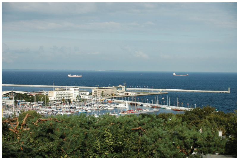
Fig. 1 Southern Pier together with the Yacht Harbour is the southernmost port pier in Gdynia, designed for coastal and yacht sailing as well as for representative and recreational functions

during the Interwar period" 2 . Earlier, in 2007, the complex was entered into the register of monuments, thus sanctioning the protection of architectural objects within its borders, which had been in place since the 1990s. It should be emphasized that as regards this protection, the city and conservation services achieved a great success, managing to have about 30 modernist objects entered into the register of monuments and over 110 in the municipal (local) register of monuments. However, certain problems are posed by the protection of the compositional values of a very important part of the complex - the protection of its main representative axis, including the establishment of the so-called South Pier, i.e. the southernmost harbor pier of Gdynia (Fig. 1).