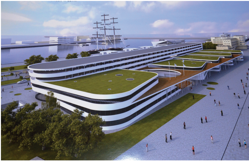
Fig. 5 One of the four entries for the "Nowa Marina in Gdynia" closed competition from 2014, clearly showing that the long, 190-metre four-storey frontage along Jana Pawła II Avenue, designed in accordance with the current local plan of the area, is a complete mistake and does not fit the landscape layout of the Southern Pier

It should also be emphasized that the current local development plan does not formulate any indications concerning the temporary development of the entire area of the South Pier – shoddy gastronomy outlets and various advertising and exhibition installations - which is being developed on a massive scale in the entire area of the South Pier. These objects, theoretically temporary, are still unpleasant, daily reality of the area.