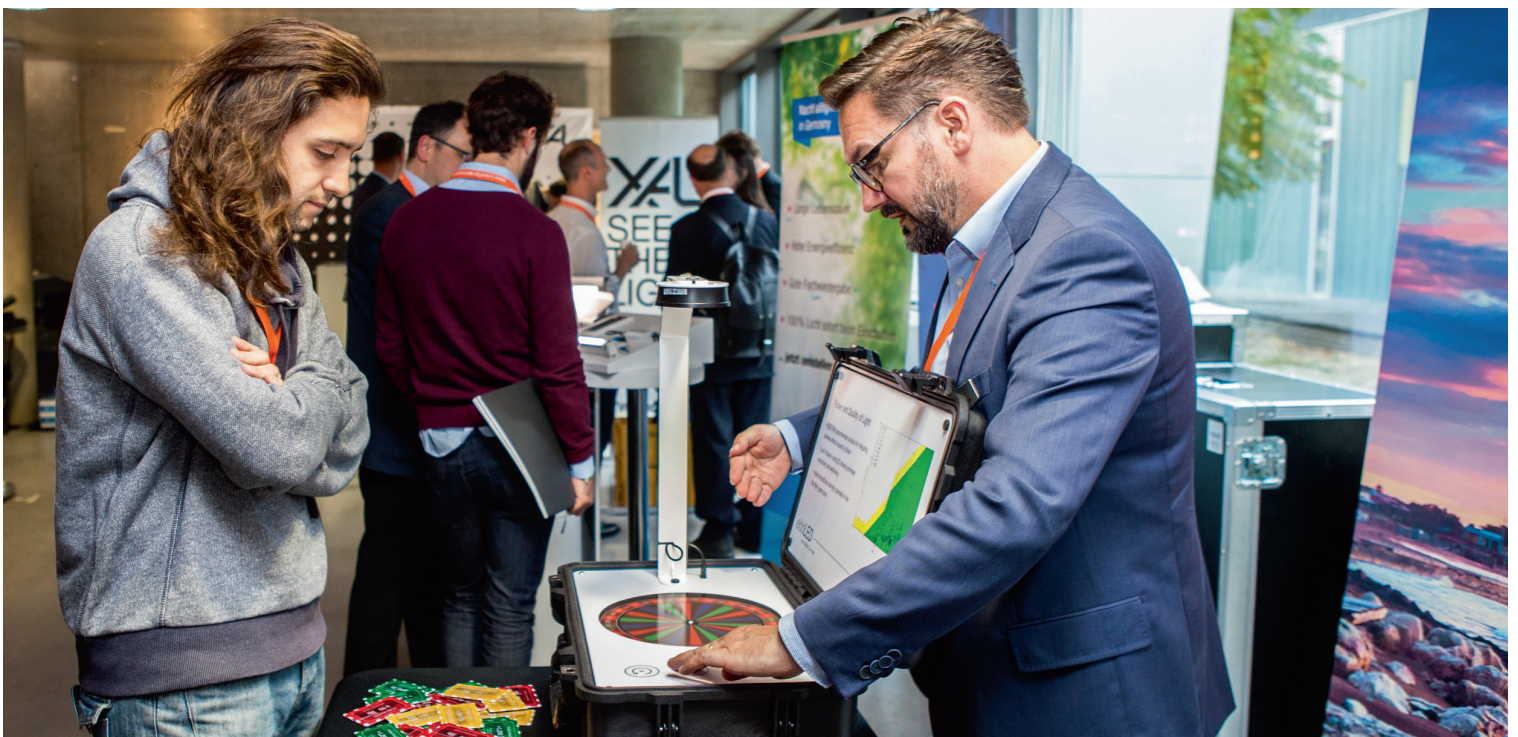
Figure 3 Impression of the LSW 2016. In this year’s event sponsors will have a chance to present and discuss their innovative lighting products to conference participants.

* Academic references are available in the online version of this article on www.arc-magazine.com and in the digital version of arc 114