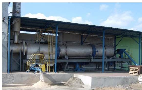
Fig. 2. The general view of the pilot-scale installation.

An experimental facility was built in the town of Ostrowite, the Lniano municipality, in Kujawy and Pomerania Province. It was developed to serve as a source of thermal energy in the form of steam for technological use in an animal waste treatment plant. The installation continuous to operate. The system consists of the rotary pyrolyzing reactor, the fluidized bed chamber and the waste heat recovery boiler. As described previously, drying and devolatilization are carried out in a pyrolyzer, whereas the fluidized bed chamber is used to combust the pyrolysis products, namely the gas components in its upper zone and the remaining solid (char) in its lower zone. Burning of volatiles takes place in a controlled manner with the multistage air supply. Char combustion in a fluidized bed is controlled by an oxygen concentration in a fluidizing gas, which is a mixture of air and recirculating flue gases. The exhaust gas generated in a fluidized bed chamber, in the first place, undergoes cleaning in a separation chamber aimed to extract the fly ash. After partially purified, the flue gas is directed to the shell-type heat recovery boiler that produces steam at pressure of 5 bars and temperature of 250°C. The view of the installation is displayed in Fig. 2.