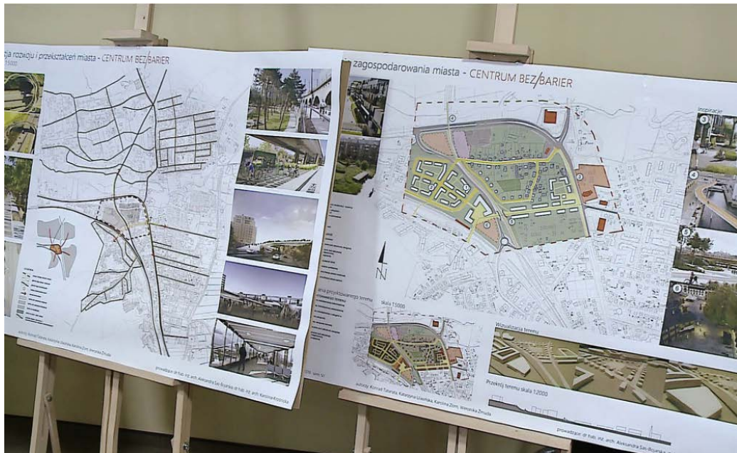
Figure 1: Exhibition and critique of student projects in Reda, northwestern Poland (Authors: K. Tatarata, K. Ułasińska, K. Zorn and W. Żmuda - Architecture course).