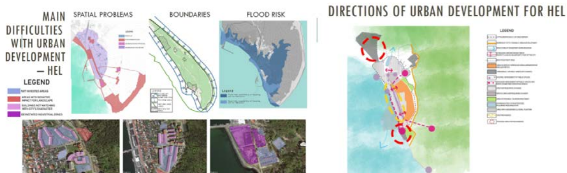
Figure 3: Student concept for the development of Hel (Authors: K. Balcerzak, J. Czeronko, M. Kalich and A. Ostrowicka - Spatial Development course).

Jastarnia, Krynica Morska, Leba, Puck, Ustka and Władysławowo (all located in the Pomeranian region). Each of these have not more than 10 to 15 thousand inhabitants. The class is held to familiarise students with the particular issues related to shaping the spatial policy of a small city - understood more broadly than the issues of spatial planning (see Figure 3, Figure 4 and Figure 5). In this case, the scale of the design depends on the size of the city and the agreement of the teacher who supervises each team.