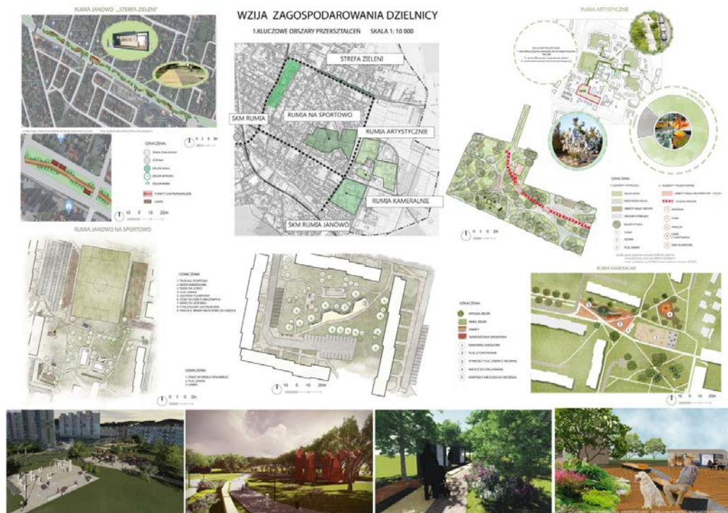
Figure 2: Development concept for the Janowo district in Rumia, Eastern Pomerania region of northwestern Poland (Authors: M. Brzezicka, K. Łakis, I. Malinowska and A. Maruszak - Architecture course).

Architecture design studio requirements include the completion of multi-faceted analyses of the functional and spatial structure of a selected district and its connections with the environment; a clear definition of the district value and the associated problems; a conceptual vision and proposal for transformation; and a formal plan for development of the selected district supplemented by a 3D model. All analyses and designs are performed most often in the scales 1:5,000 and 1:1,000.