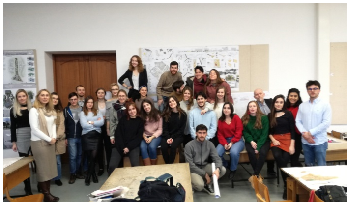
Figure 3: Final presentation of students' designs.

Working on the integration of urban and environmental solutions students developed original concepts. Among them were projects that presented new concepts for spatial development in an interesting way, with a special emphasis on public space. The best projects showed an integration of existing and designed space through the arrangement of public space, the role of which was revitalisation (of the space). Some projects incorporated attractors in the form of various functions (e.g. commercial, cultural, entertainment). In others, the creation of new connections was represented, to minimise existing barriers. The inclusion of sport and art as elements of public space also played an important role in students' designs. Public spaces are important in promoting a healthy lifestyle and encouraging various activities (Figures 3 and Figure 4) [11].